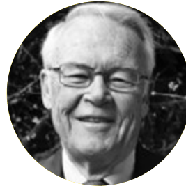
David Aaker Vice-Chairman, Prophet and Professor Emeritus UC Berkeley

The Case Studies, Briefings, Vocational Articles, and Applied Research published in the Henry Stewart Marketing & Digital journals are from some of the leading marketing executives and experts in the field. A tiny selection of published authors includes: