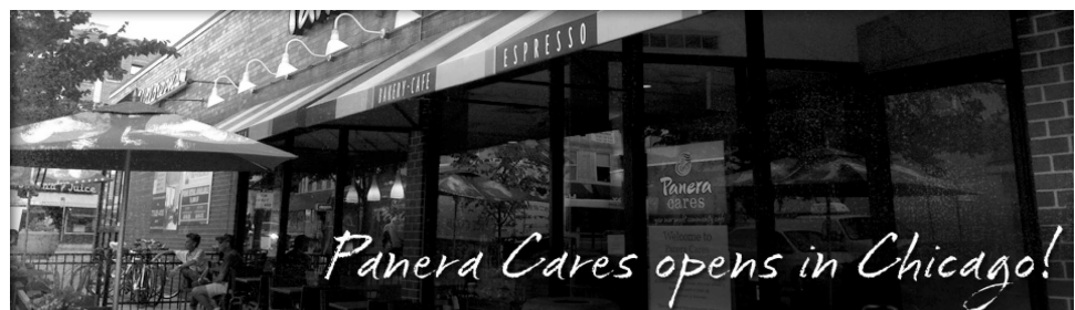
Figure 2 The ‘Panera Cares’ community café

The Panera Cares Café concept is a brave and bold experiment in human