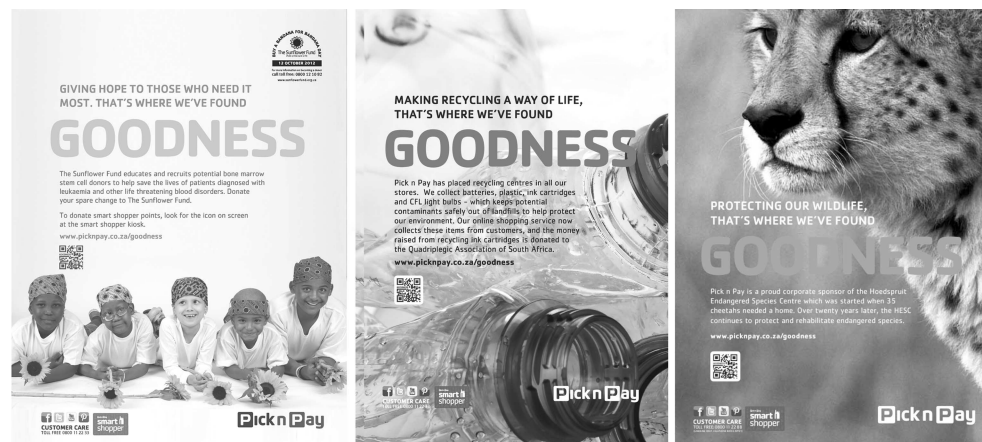
Figure 3 Pick n Pay has a history of advocating social change in a challenging environment

Franchisees from these communities have proven to be an asset. It opens opportunity at the local level when shoppers know they are doing business