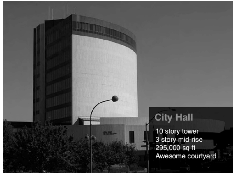
Figure 9 Zappos has renovated iconic structures such as City Hall for use as corporate headquarters

business should be designed to hire locals and take them on an upwardly mobile career. Start-ups such as Rumgr and Romotive gained their start in this way.