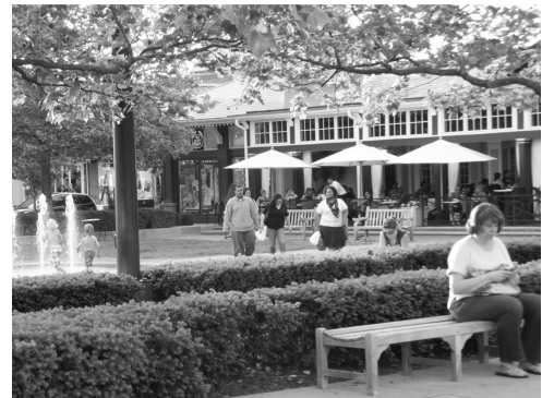
Figure 4 The Greene in Dayton and Bayshore in Milwaukee