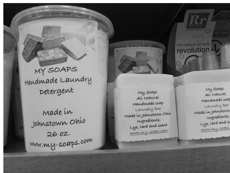
Figure 5 Celebrate Local sells only Ohio-produced handmade products

Even before the opening of Easton, the Easton Community Foundation was launched, dedicated to organising philanthropic efforts in support of local citizens and causes. In 2012, Easton once again received the 'Benefactor of the Year' award 8 for local community contributions that were comparable to those made by local Fortune 500 companies such as KPMG and ABBOTT. Giving back to community is literally designed into the Easton experience, where proceeds from their parking meters have gone directly to local charities since the 1999 opening of Easton. Easton has become such a beloved