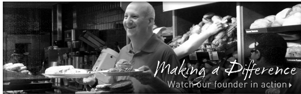
Figure 1 Ron Shaich, Panera Chairman and co-CEO

Panera is a great example of industry leadership that is both profitable and purposeful. Over the last decade, under the direction of Ron Shaich, Founder, Chairman and co-CEO (Figure 1), it has become the second-best performing restaurant stock, and the second-best performing consumer stock in the S&P consumer index. Panera has grown into a national chain of nearly 1,600 bakery cafés across 40 states and Canada.