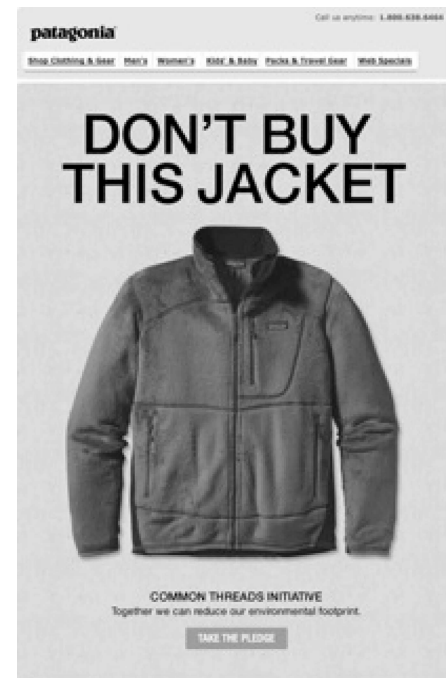
Figure 6 Patagonia's 'Don't Buy' campaign

By pursuing a socially responsible approach to retail and consumer consumption, Patagonia has earned not only the trust and loyalty of its existing customers, but in